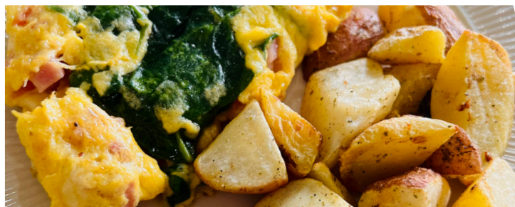
Create Your Own Omelette